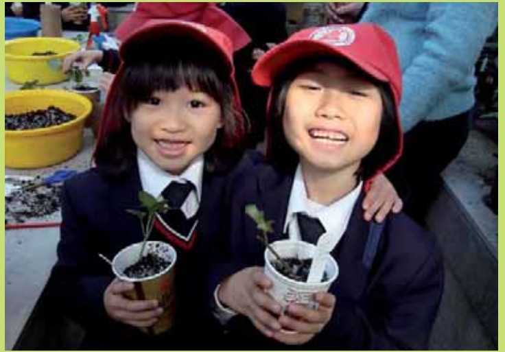
Year 1 Botanic Gardens