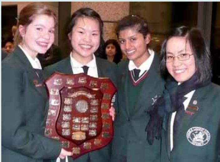
The Senior B debating team