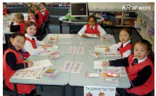
KR at work