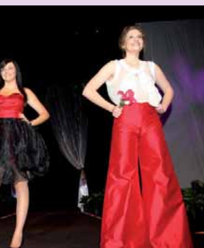
Technical Precision Award), Technical Precision Award), Technical Precision Award)