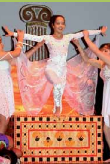
Wings of Hope