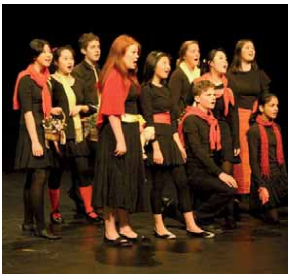
The chorus singing 'The Backerville Festival'