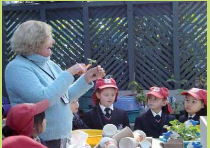
Year 1 Botanic Gardens

Year 1 also followed the Olympics with interest, keeping a medal tally and learning about the special Olympic mascots. The girls also enjoyed reading and discussing the short-listed books throughout Book Week and wrote some wonderful pieces about their favourite book.