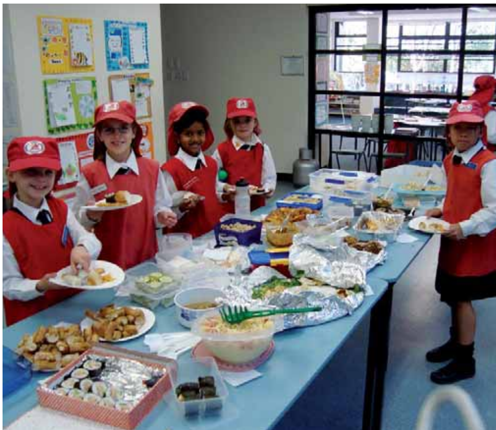
Year 2 Food Expo

The human society and its environment topic 'Aboriginal Culture' has been a favourite unit for Year 2. The girls visited the Art Gallery of New South Wales to view a variety of Australian artworks and enjoy the stories and history behind them. We are looking forward to a visit from a Torres Strait Islander group that will share Dreamtime stories, dance and Indigenous art.