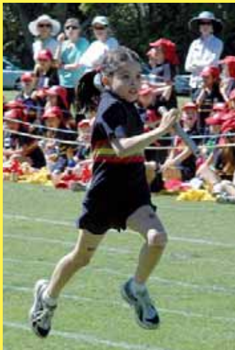
Preparatory School Athletics Carnival

In gymnastics the girls enjoyed rhythmic, exploring basic movement skills using hoops, ropes, clubs and ribbons. It was pleasing to see all girls using their imagination and even creating and performing movement sequences and routines.