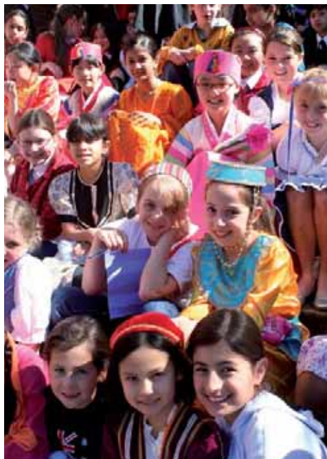
Costumes from around the world