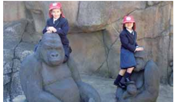
Above and below: Kindergarten at the Zoo

Bounce Back is a resilience program that is new to Kindergarten. The girls are given opportunities in class and during grade assemblies to discuss friendship issues, values and their thoughts and ideas. Wednesday assemblies are also a great forum for Bible stories, songs, prayers and reflections.