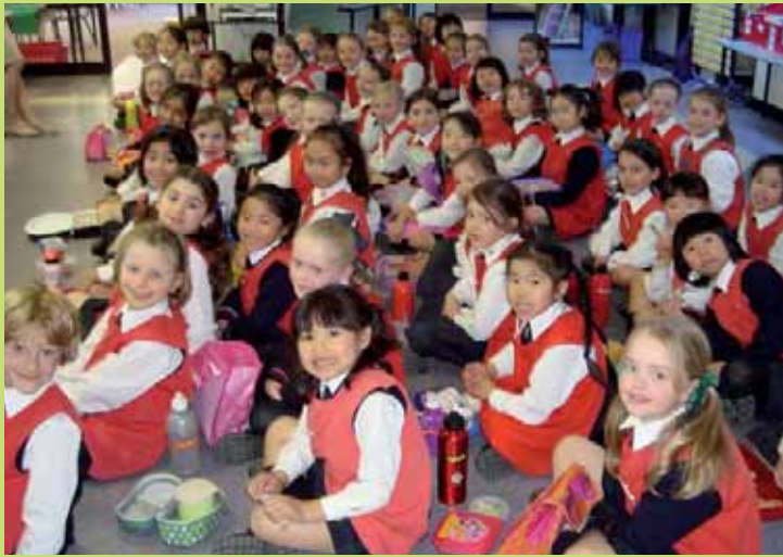
Year 1 Rubbish Free Lunch Day