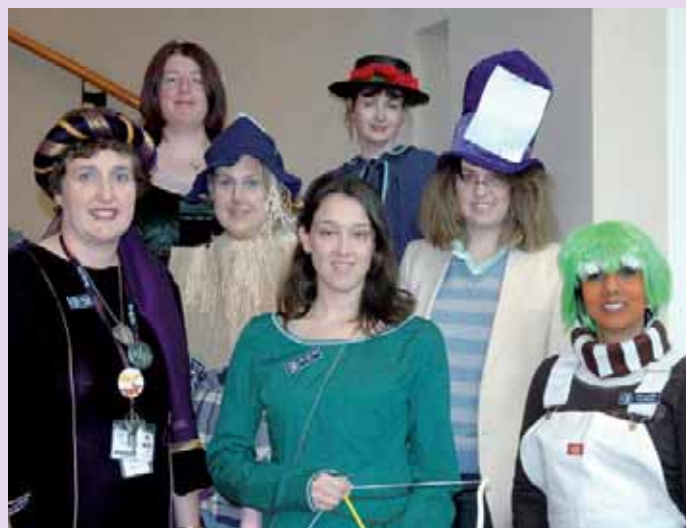
Conde Library Staff all dressed up for Book Week