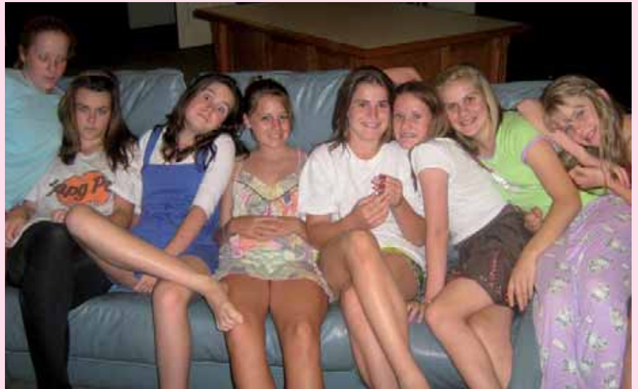
Above: Year 8 Boarders hanging out