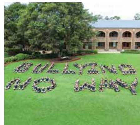
Our girls were inspired to "speak up even if your voice shakes" (page 25)

Welcome to the second issue of Pymbulletin for 2018.