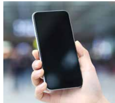
Read about our Mobile Phone Policy for Middle and Upper Schools (page 4)