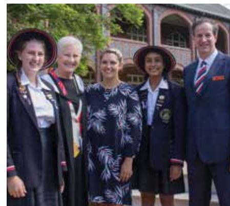
Our Foundation Day tradition continues to bring our community together (page 14)