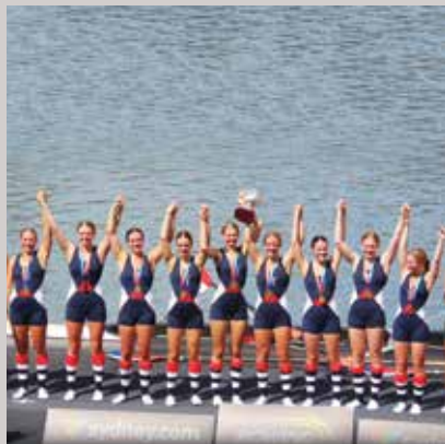
Front cover Read about our oar-some success story on page 36.

About Pymble Ladies' College Celebrating 100 years of education in 2016, Pymble's history has been marked with excellence. The College has gained a reputation for offering extraordinary opportunities with outstanding teachers and facilities. Pymble students aspire to the College motto, 'All' Ultimo Lavoro' – Strive for the highest, graduating with confidence and maturity to embrace the challenges that lie beyond the College gates. A school of the Uniting Church in Australia, Pymble welcomes girls of all faiths in Kindergarten to Year 12 and as Boarders' from Year 7.