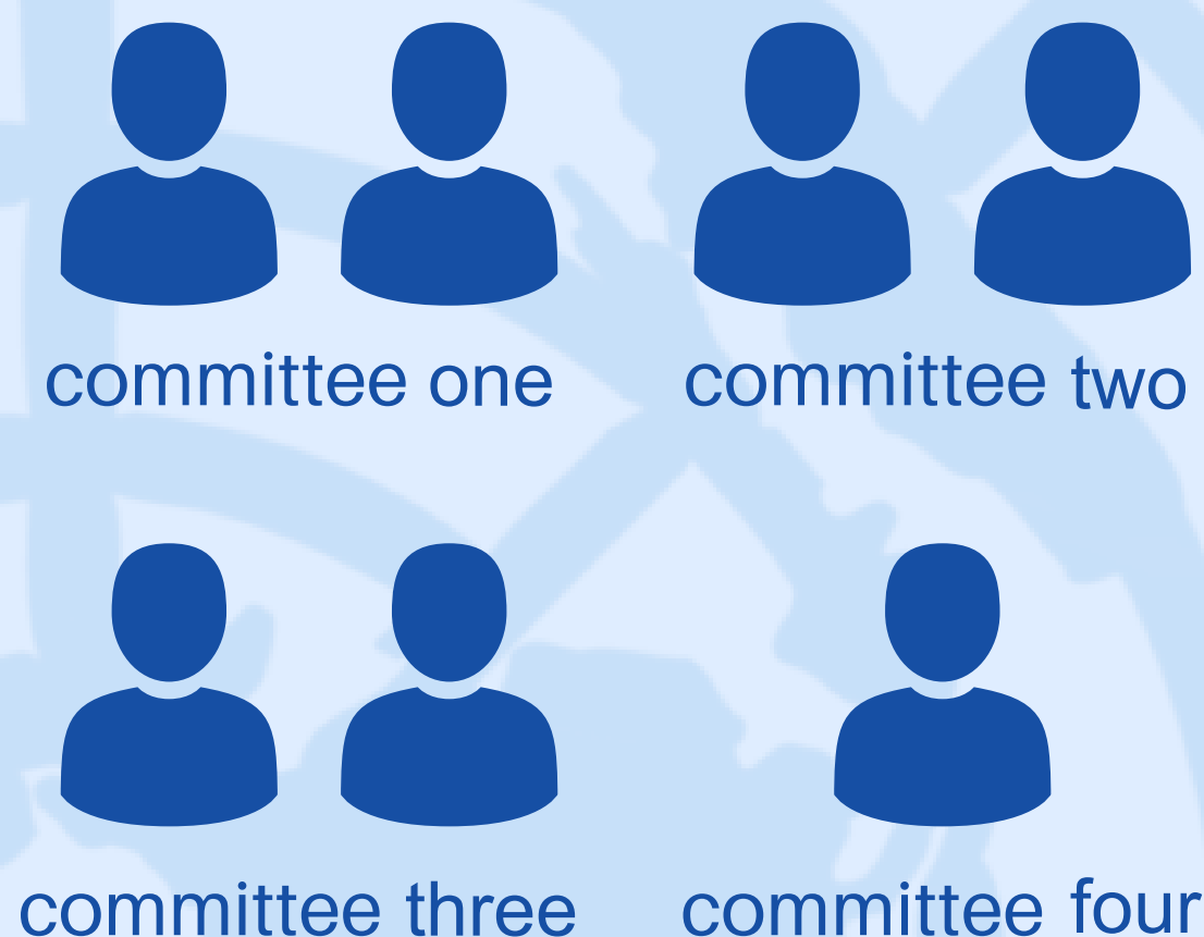
Example: Delegation of seven